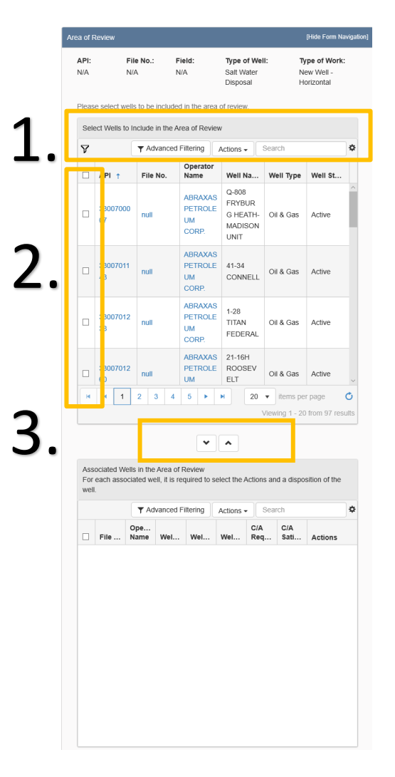
Figure 4: Picker Grid Guide showing advanced filtering (1), selection of wells (2), and selection arrows (3).

icon " T to choose whether you would like the filter to be: equal to, not equal to, starts with, contains, does not contain, ends with, is null, it not null, is empty, is not empty, has no value, or has value.